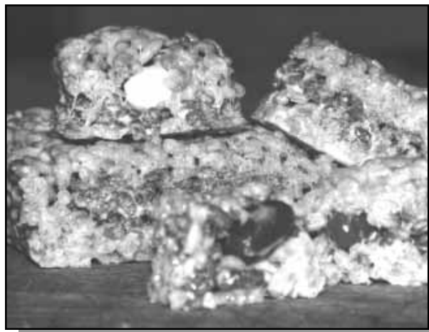
Rice cereal treats — (meteorite breccia).

Throughout this step, the teacher will verify correct pairs. Expect questions like, “Is number one peanut brittle?”. When they have found the “Field Note” that describes their sample, students should place their sketch, description, and sample next to the correct “Field Note” description. Reward the