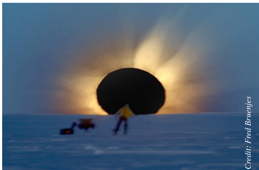
As the Sun begins to emerge from behind the Moon, a brightening on the Moon's edge creates the "diamond ring" effect