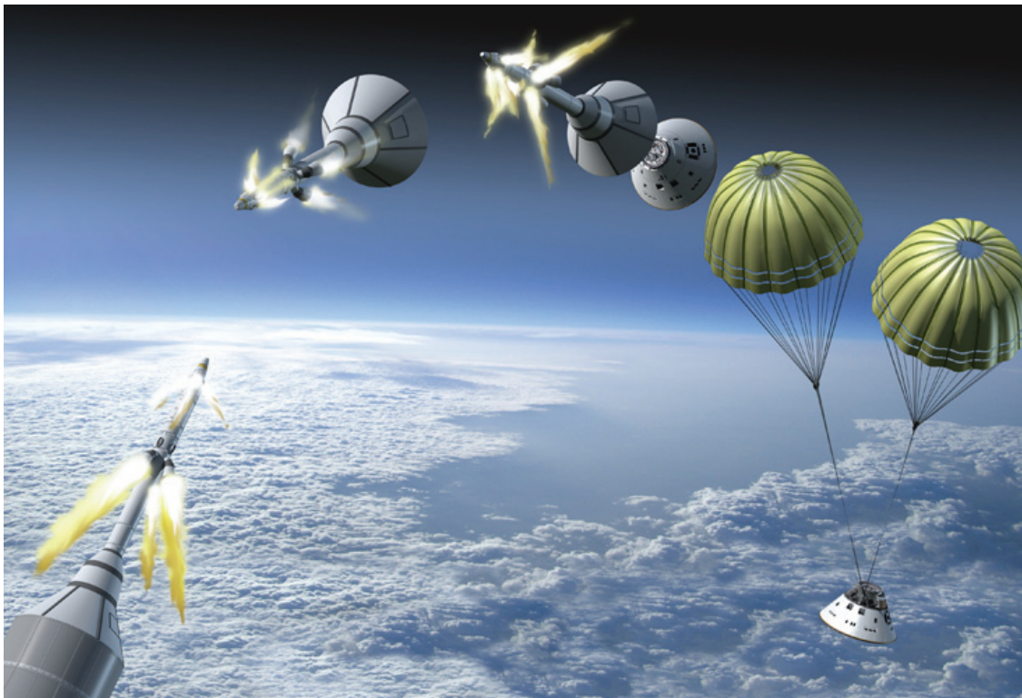
Orion's launch abort system is designed to pull the crew module to safety in an emergency.

If a launch pad or in-flight emergency occurs, the abort and attitude control