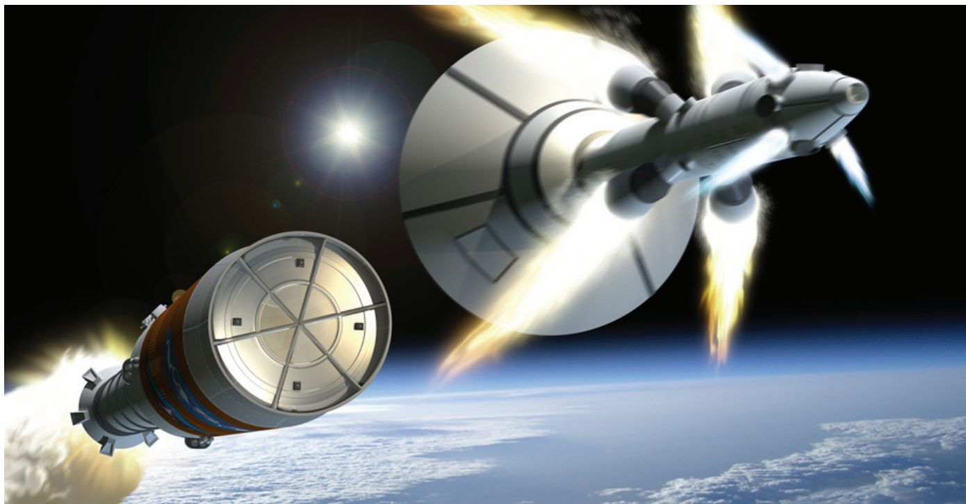
If an in-flight emergency occurs during ascent, the launch abort system will pull the Orion crew module safely free of the Ares I launch vehicle.

NASA's Glenn Research Center in Cleveland, Ohio, will conduct thermal, acoustic and mechanical vibration and electromagnetic compatibility testing on the launch abort system and the fully assembled spacecraft.