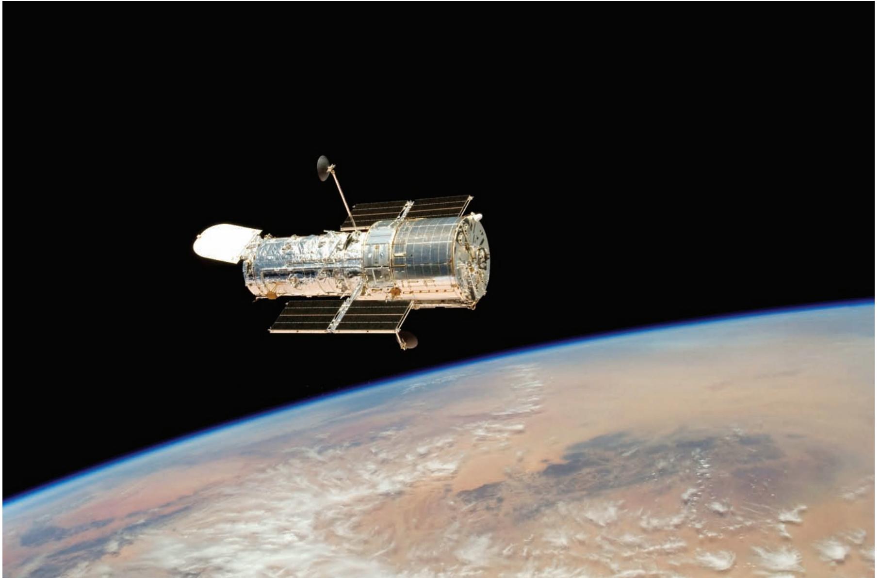
The Hubble Space Telescope