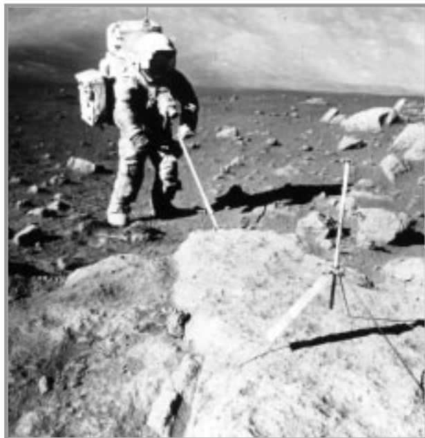
Apollo 17 was launched December 7, 1972. Here astronaut Harrison Schmitt works with a lunar scoop in the Moon's Taurus-Littrow mountains.

A major goal of science is prediction. Once generalized theories are formulated, then experiments are designed to test the theories through their predictions. Some experiments that could address the questions of earth scientists simply cannot be performed on Earth because of their monumental proportions. What could be more illustrative, elegant, or challenging than to