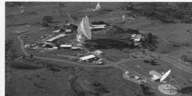
The DSN complex near Canberra, Australia

By using information derived from the spacecraft's signal, mathematicians are able to determine the precise location and motion of the spacecraft — vital data needed for navigation. Commands are sent back, or uplinked, to correct the spacecraft's course or set it in orbit around a planet at the precise time for “orbit insertion.”