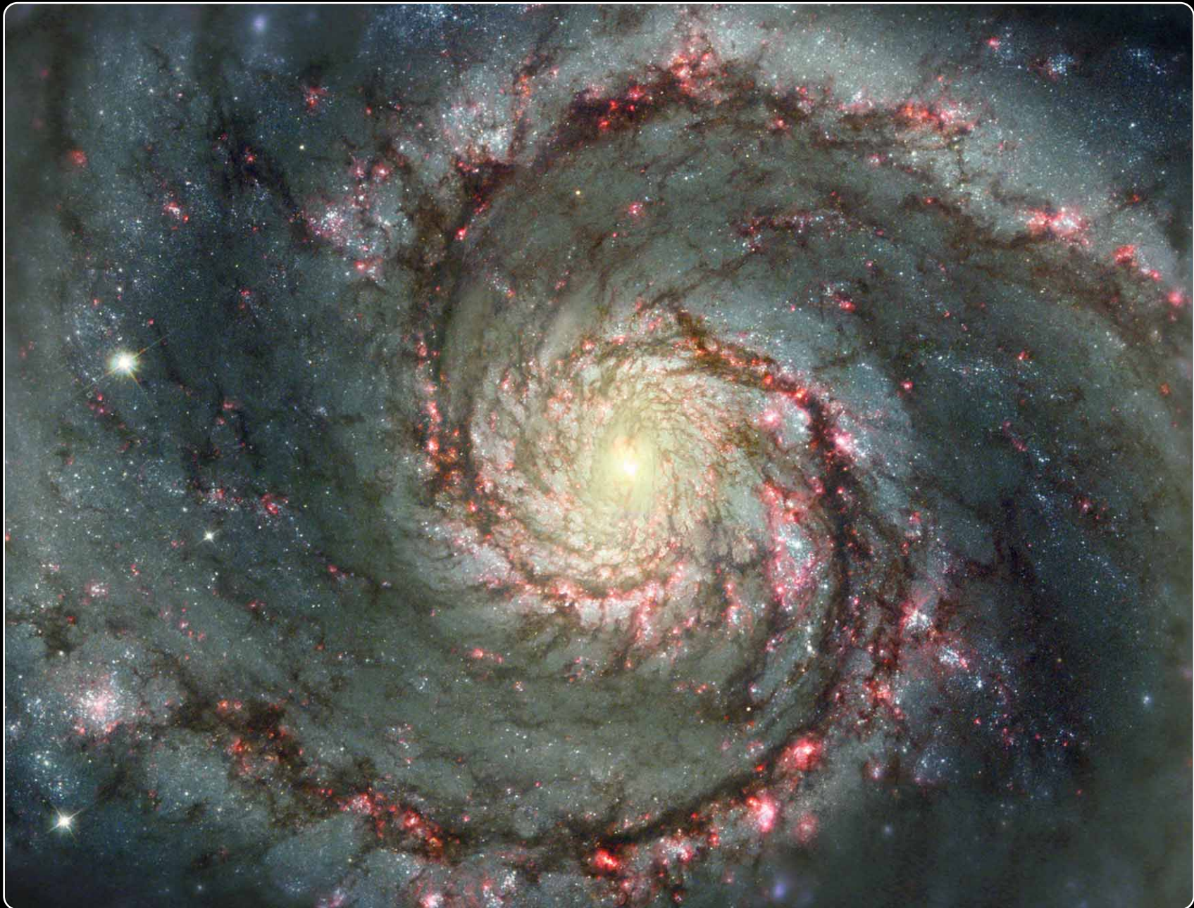
Center of Galaxy M51: The Whirlpool Galaxy