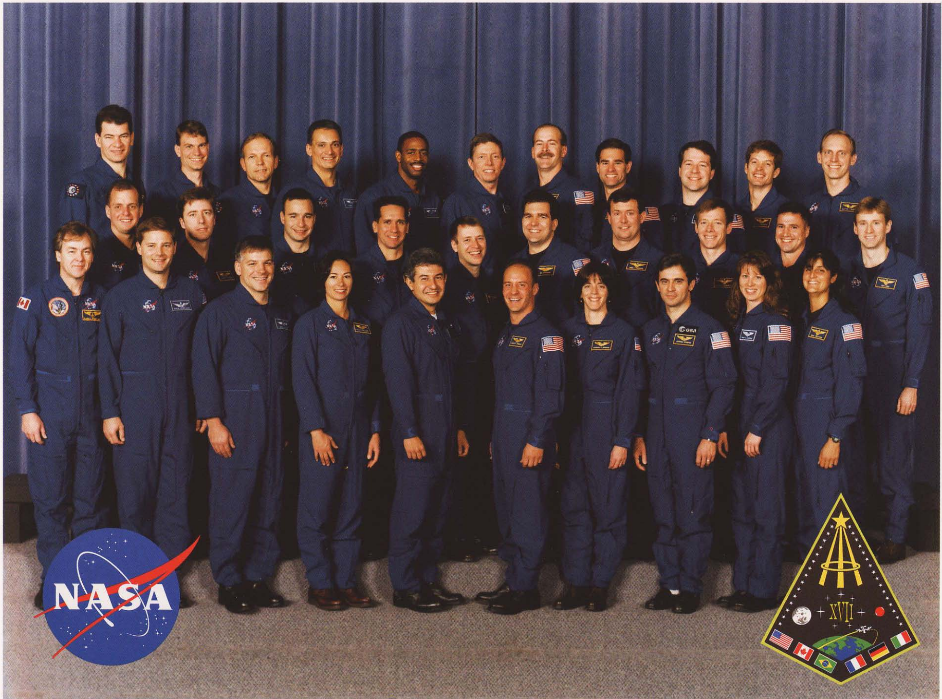
Astronaut Class of 1998